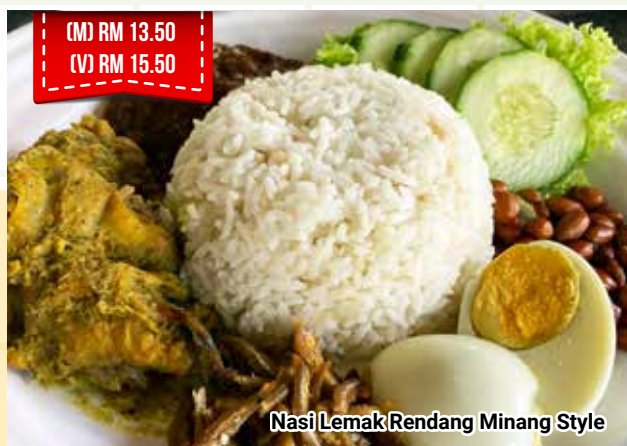
Nasi Lemak Rendang Minang Style